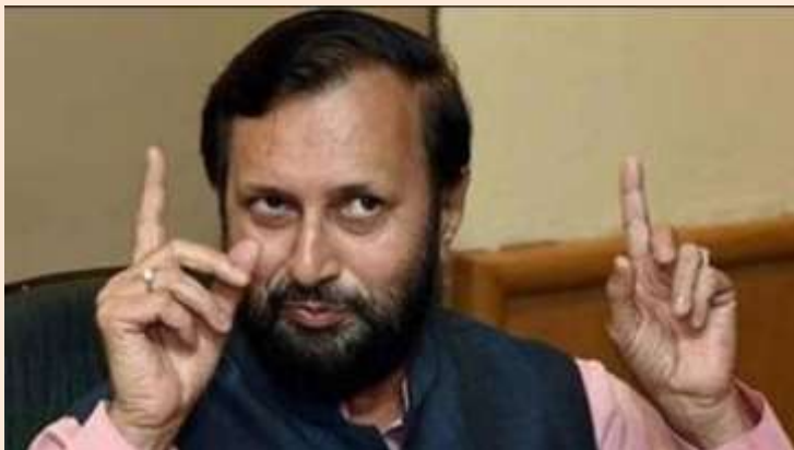
Two commissions to replace UGC, proposes HRD Minister

https://www.indiatoday.in/education-today/news/story/ugc-replaced-2-commissions-heci-draft-bill-to-be-finalized-cabinet-soon-1294343-2018-07-24